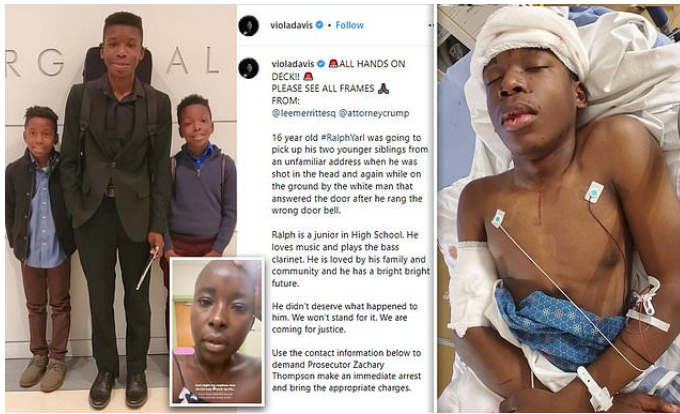
Viola Davis supports family of black teenager shot by white homeowner