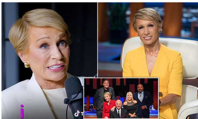
Barbara Corcoran backlash: 'I love firing people on a Friday'