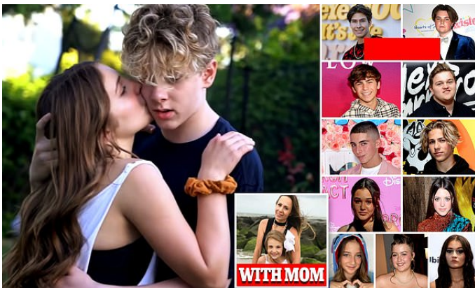
YouTubers mom faces abuse allegations from 11 teens