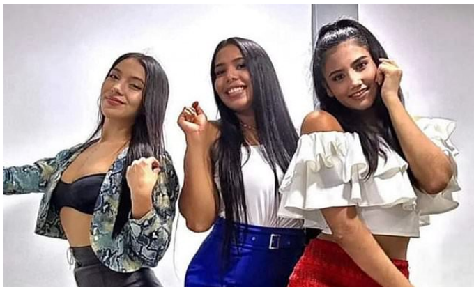
Two of three young women murdered on vacation sent ominous texts