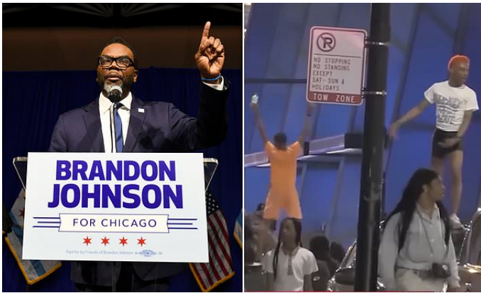
Chicago's new mayor says teens need 'spaces' after violent takeovers